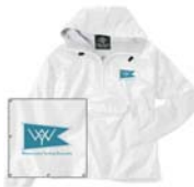
Share & Sell(TM) - LogoSportswear.com

Remember the WYA apparel store web site. Many cool items for sale. Put it in your favorites tool bar! Order now to get yours.